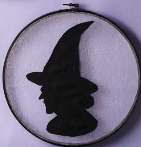
Templates 15% of Actual Size