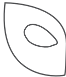
Deer eye patch