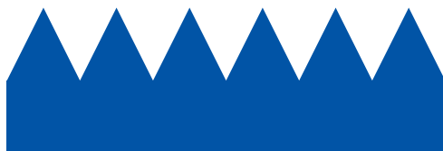
Final Crown Shape (NOT actual size).

Note - This template has been scaled and is 50% of actual size. Print this template at 200% to make it full size.