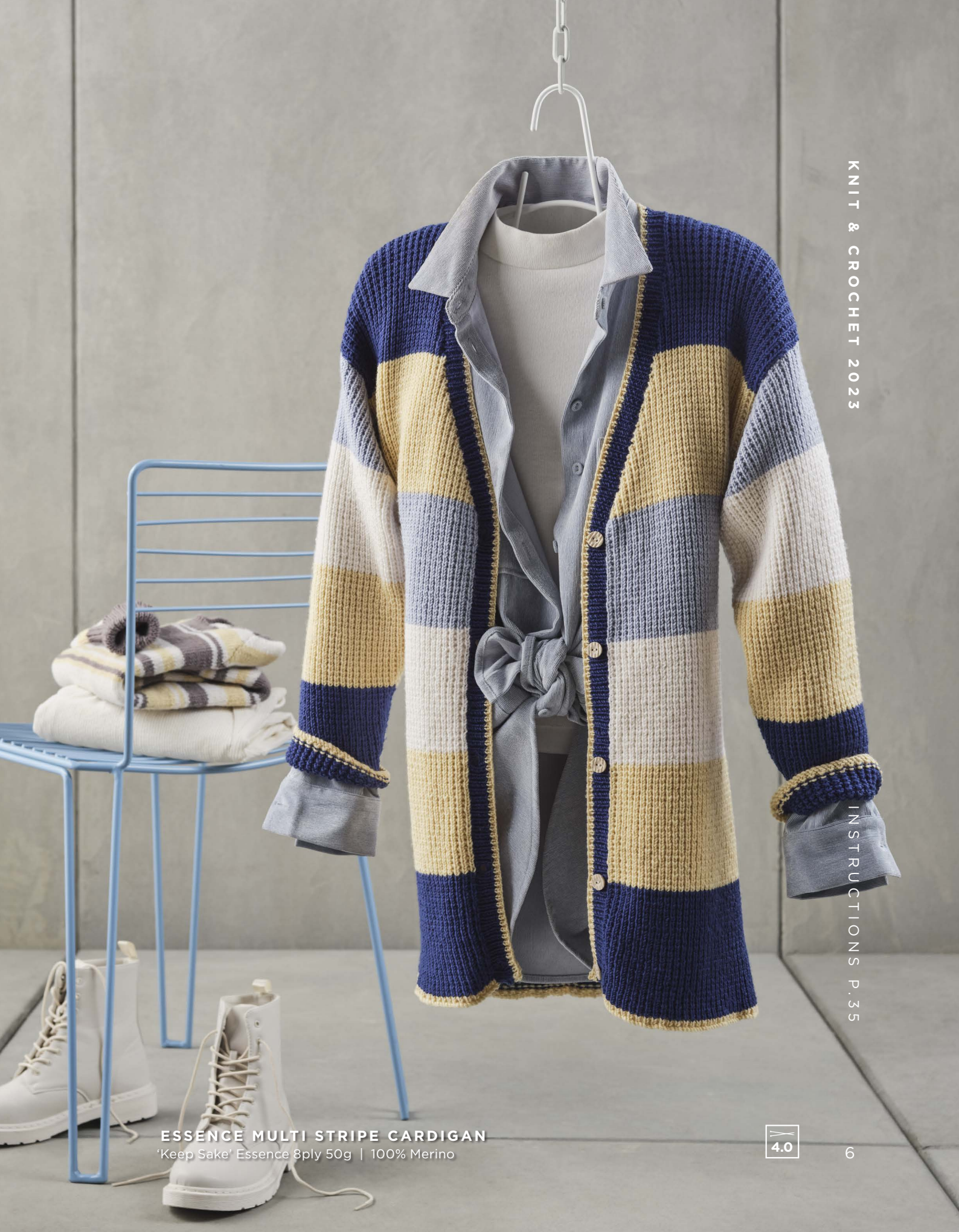
ESSENCE MULTI STRIPE CARDIGAN 'Keep Sake' Essence 8ply 50g | 100% Merino