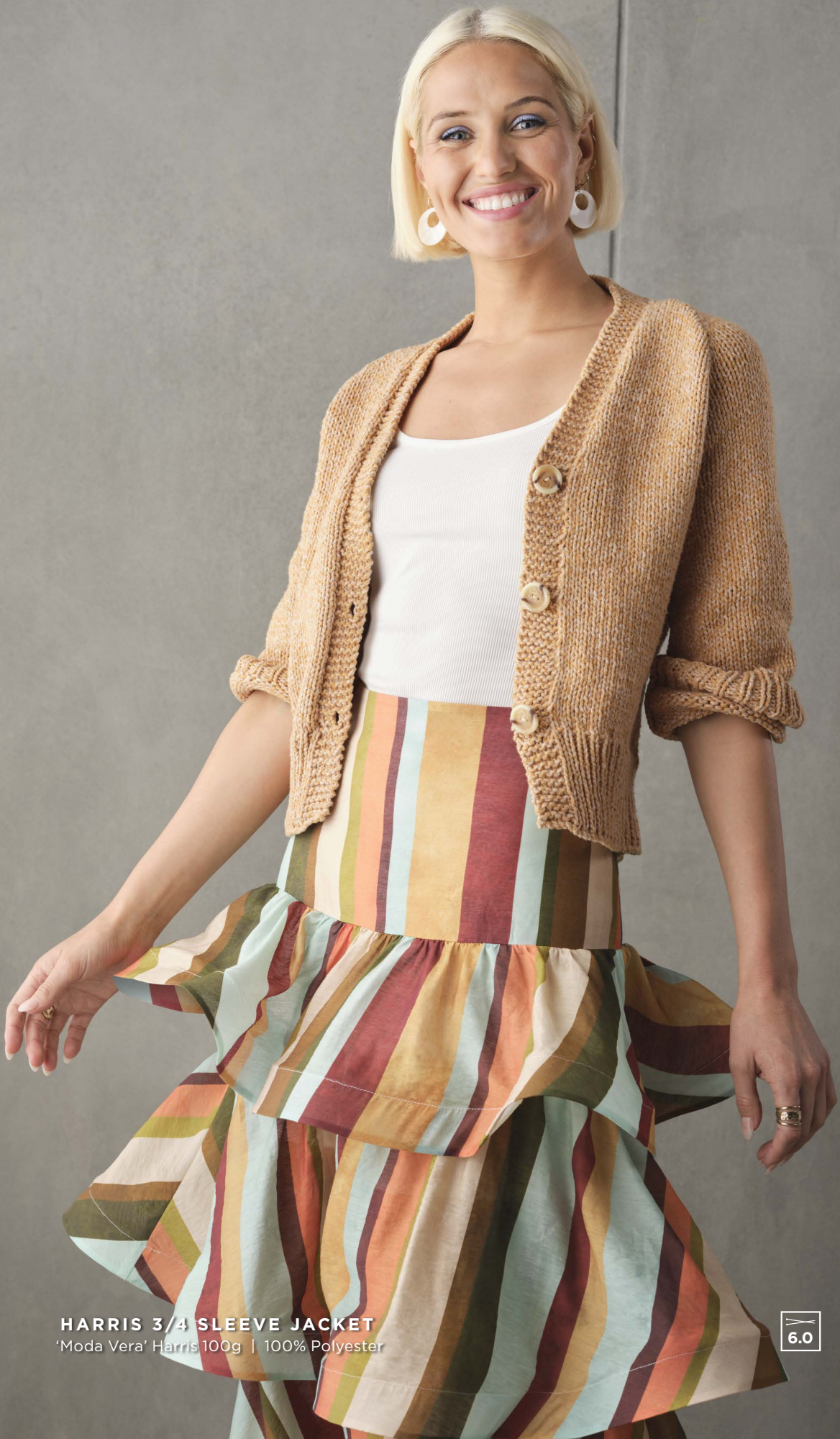
HARRIS 3/4 SLEEVE JACKET 'Moda Vera' Harris 100g | 100% Polyester